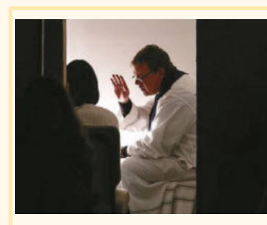
Confession Times Wednesdays 5:00-6:00pm Saturdays 3:30-4:30pm

Wednesdays, after the 9:00am Mass until Reposition after the Divine Mercy Devotion.